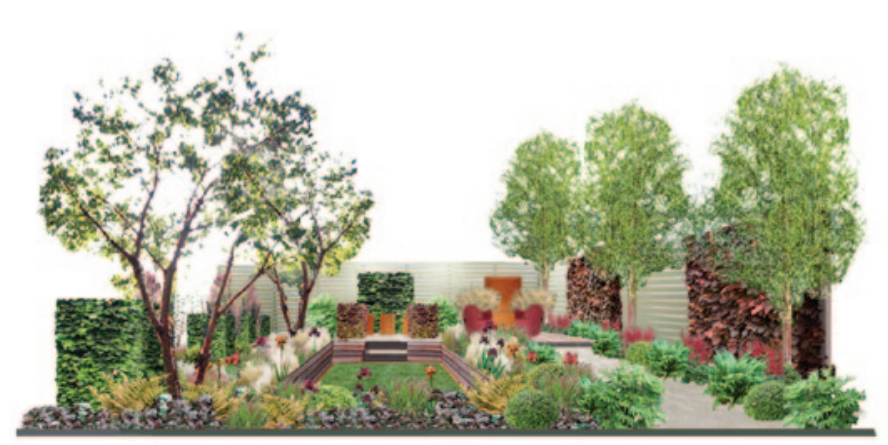
CAD design for the VaRa Foundations for Growth Garden created by Miriam Gopaul

A garden design and survey drawing will be produced during the course. You will then be introduced to more advanced drawing techniques including producing planting plans using the plant database in the latter part of the course.