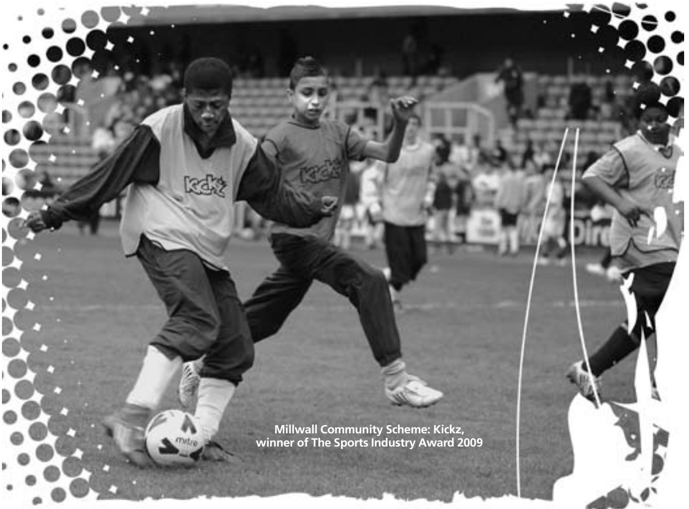
Millwall Community Scheme: Kickz, winner of The Sports Industry Award 2009