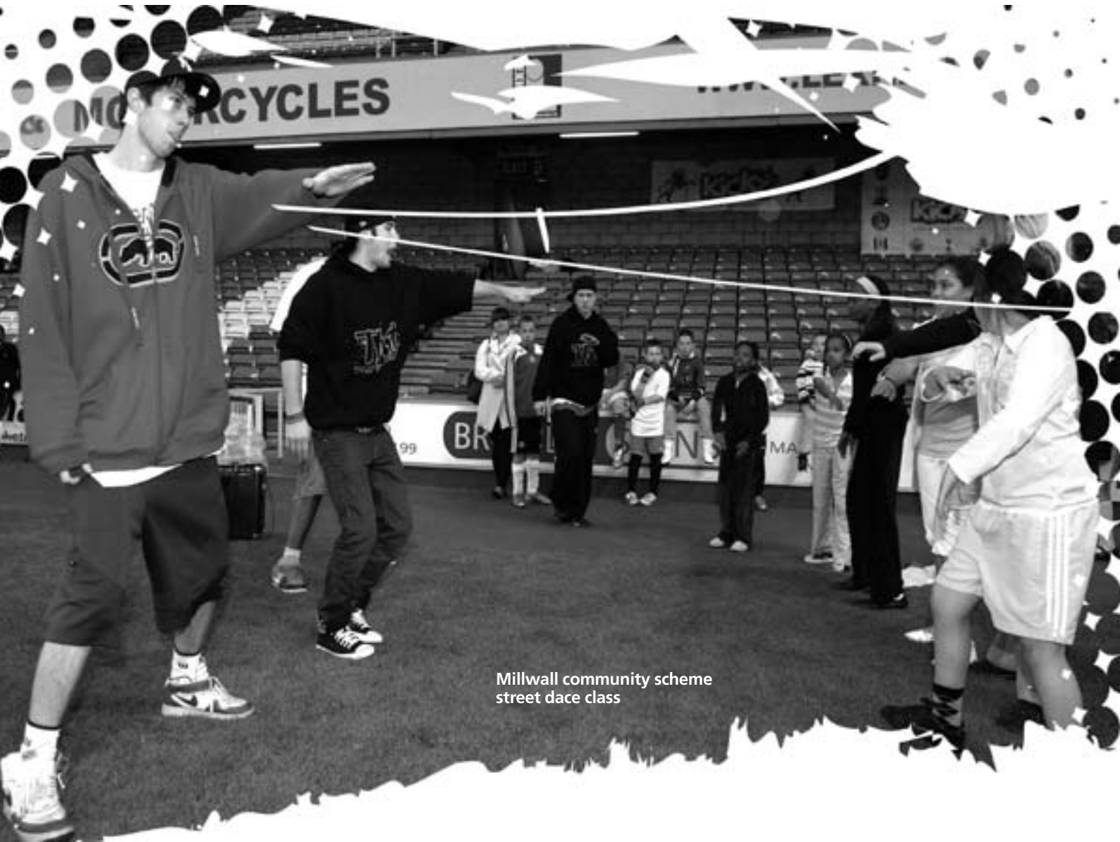
Millwall community scheme street dance class

local area at community council level and at Young Southwark executive meetings. YCC members are elected once a year through elections which young people across Southwark can get involved in.